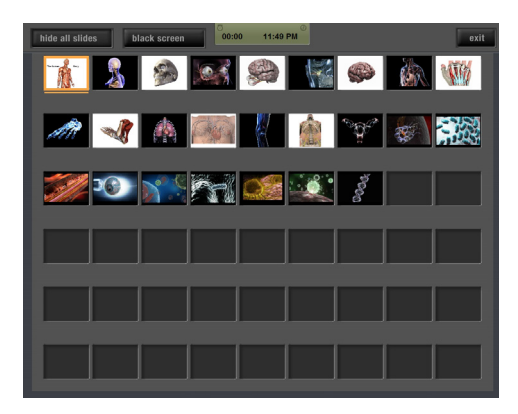
sho-Q Presentation selector