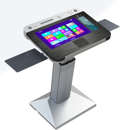
Optional: Keyboard Touch pad 7" Control Panel in Top 10" Control panel Integrated Audio